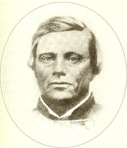
Brigadier General Thomas Green ("The Battle of Stirling's Plantation" page 30)